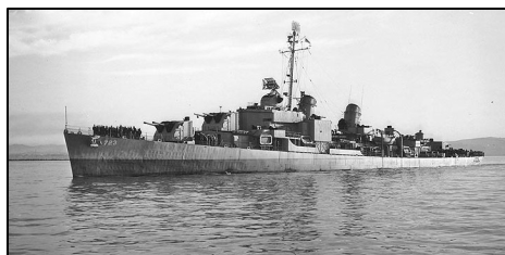
USS Walke (DD-723)

Gunners on destroyer Walke (one of the minesweeper screens) battled four attackers. They shot down two, but the wing of a third—a Zeke armed with a bomb—sliced into the bridge. Bill Rugh, 19, a port side 20-mm gunner stationed just below the bridge, ducked an instant before the plane's wing hit. When Rugh got to his feet, his shirt and dungarees were burning, but he quickly put out the fire, sprinted to the railing and leapt feet first to the main deck. Fleeing barely a stride behind Rugh was Pete Ryan, the gun's loader. Ryan had been soaked in gasoline and burned like a torch until