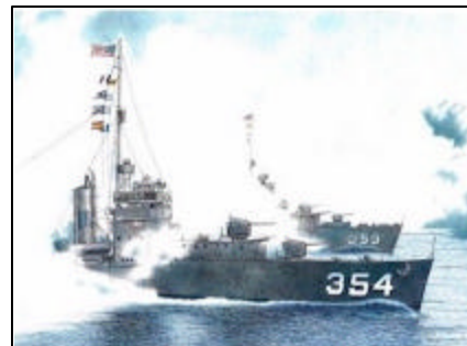
USS Monaghan (DD-354) and USS Dale (DD-353)