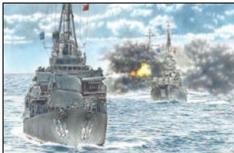
USS Wedderburn (DD-684) and USS Porterfield (DD-682)