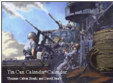
USS Halford (DD-480)